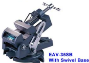
EAV-35SB With Swivel Base